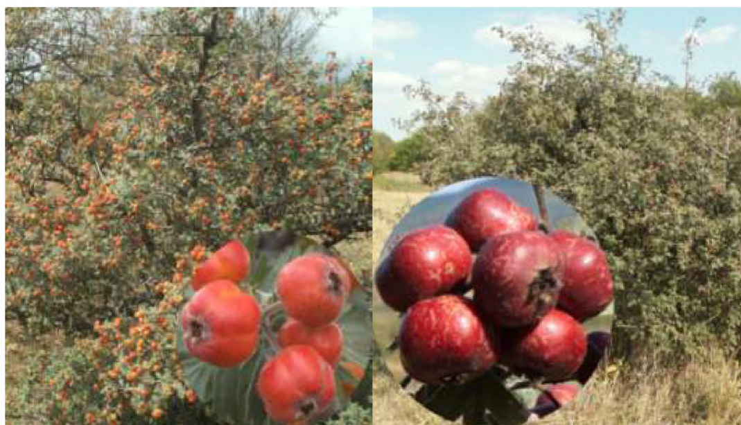
Fig. Habit view and fruits of Crataegus orientalis (on the left) and Crataegus tournefortii (on the right)

Crataegus tournefortii Griseb. (= C. schraderiana Ledeb.) is an east-mediterranean cultivar, being entered into the “Red Data Book of Ukraine” (category “vulnerable”) [11]. It is a hybrid origin cultivar, bred of Crataegus of two different sections: C. orientalis Pall. ex Bieb. (section Azaroli Loud.) and C. pentagyna Waldst. et Kit. (section Pentagynae C.K. Schneid.). Recently most authors have considered this cultivar as subspecies of C. Orientalis [3, 15]. Other authors in opposite believe it is a separate species [9, 12, 16]. We hold the second opinion. According to K.M. Zavadsky [4], subspecies spatially exclude each other, that is an area occupied by one definite taxon cannot be inhabited by another, they just mix on the narrow border lines. In all study populations C. Tournefortii grows in combination with C. Orientalis . Besides in nature being in generative condition they have visual distinctions (table 1).